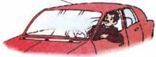
2. This man drives _____ .