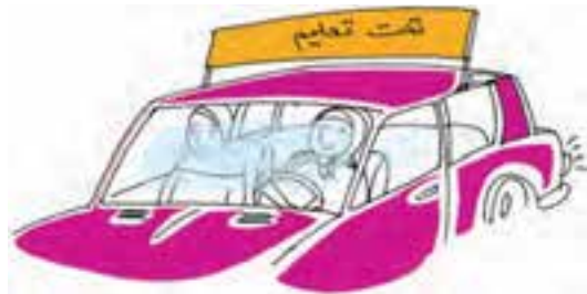
4. This woman drives _____ .