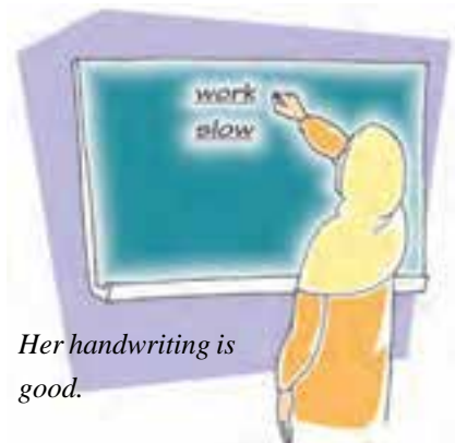
Her handwriting is good.