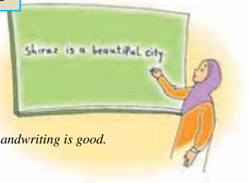
Her handwriting is good.

Example: This student writes English well. _____