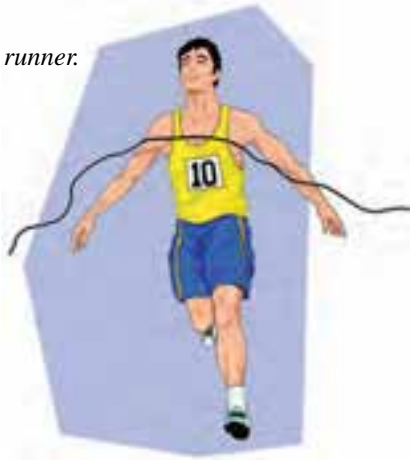
1. He runs _____ .