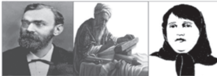
Alfred Nobel Abu-Reihan Birooni Parvin E'tesami

People have always been interested in reading about great men and women. They want to know what makes such people famous. This lesson introduces two of them.